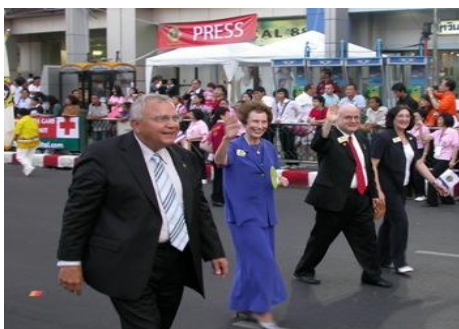
Our Lions at the LCI Convection in Bangkok Thailand. More pictures can be seen on our District 22-D website. Lionsclubs.org